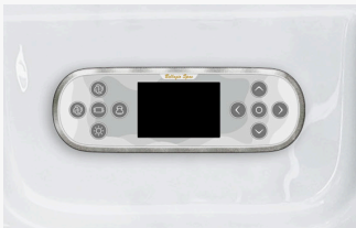
Digital Topside Control