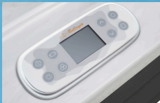
Digital Topside Control