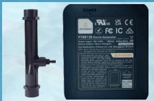
Corona Discharge Ozone