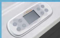
Digital Topside Control