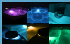
Northern Lights Package